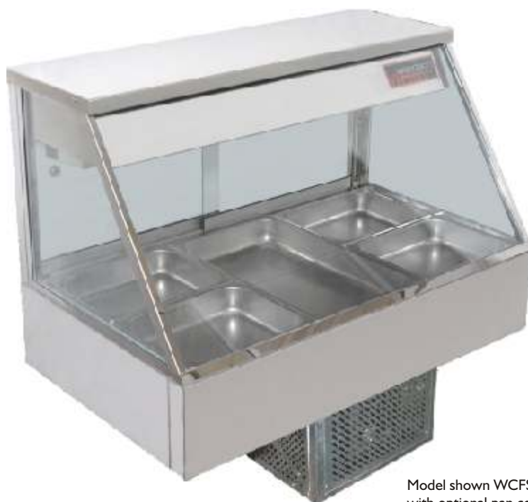
Model shown WCFS23 with optional pan combination